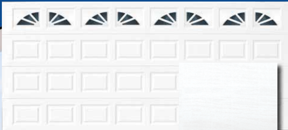
Model 625 SP with optional Sherwood Windows