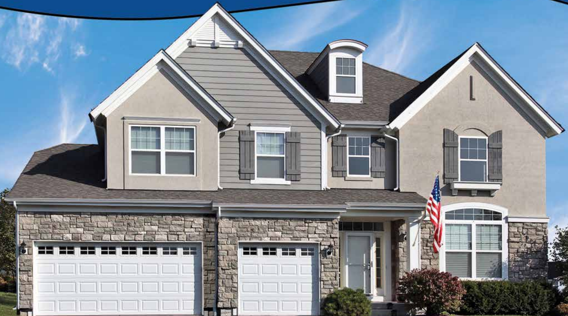
Model 225 SP with optional Stockton windows