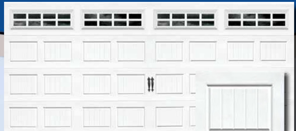
Model 325 SP with optional Stockton Windows and Decorative Handles