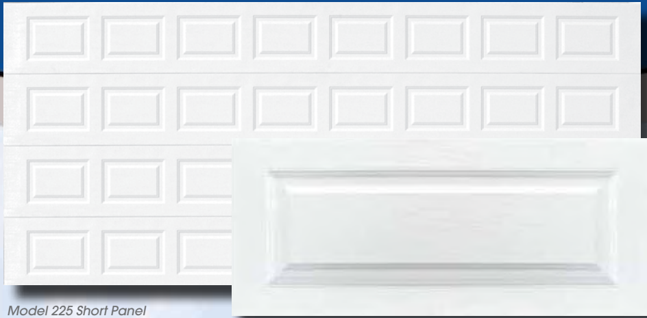
Model 225 Short Panel