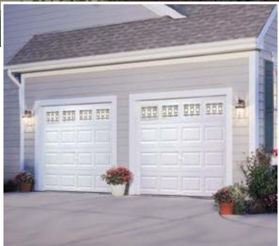
Model T41S, Short Traditional Panel with Optional Short Trenton® Window Design