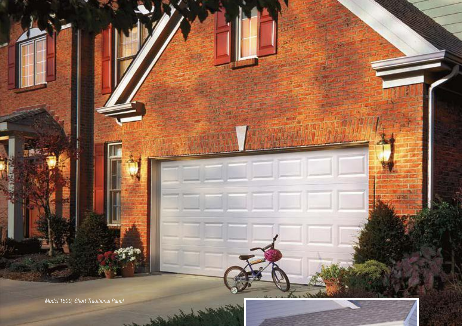
Model 1500, Short Traditional Panel