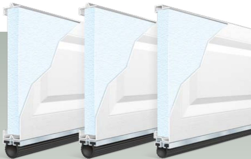
Tongue-and-Groove Section Joints