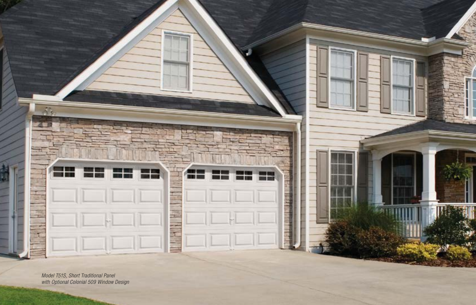
Model T51S, Short Traditional Panel with Optional Colonial 509 Window Design