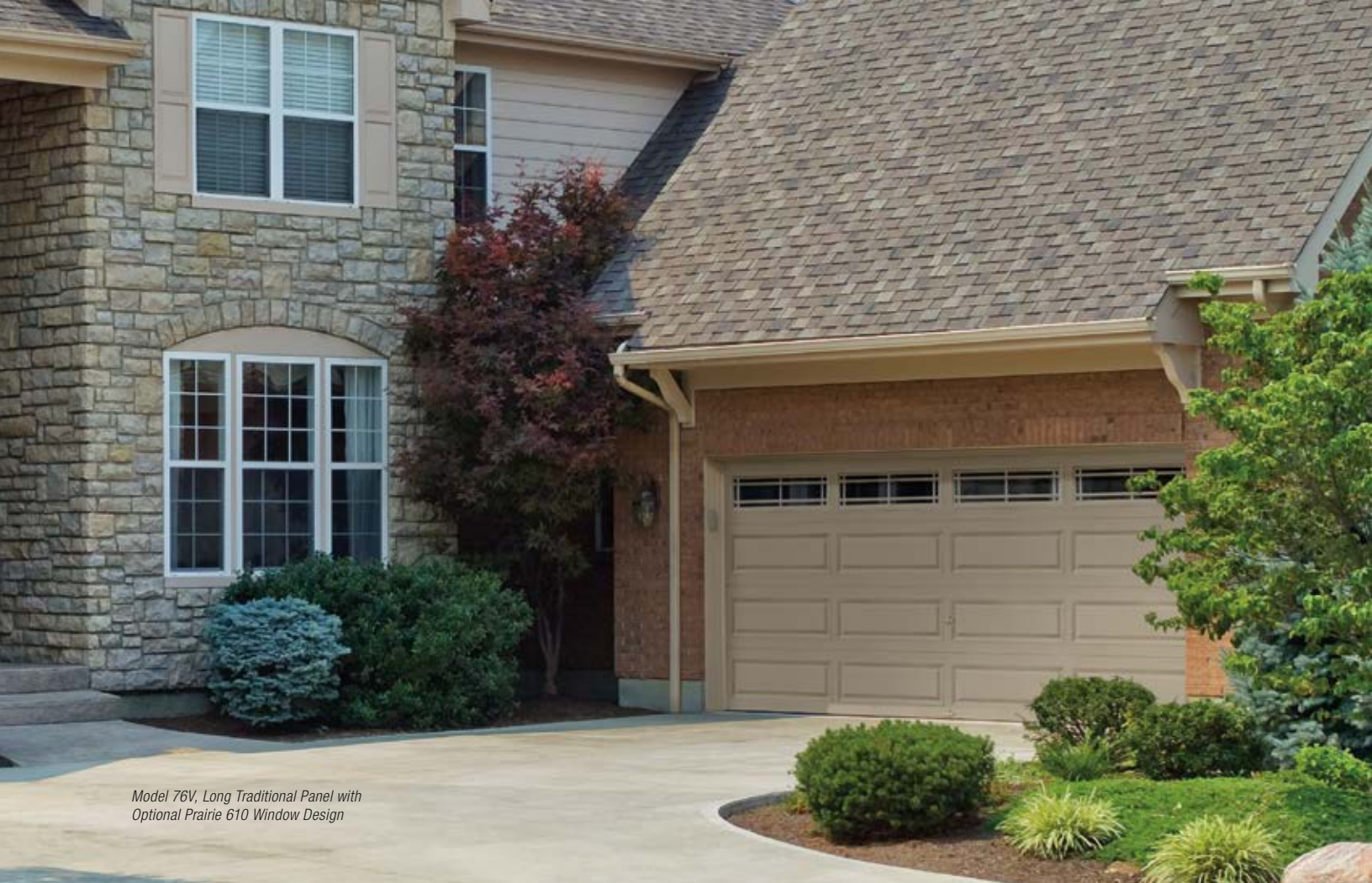
Model 76V, Long Traditional Panel with Optional Prairie 610 Window Design